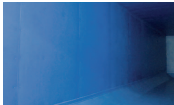
Wall / floor lining transition