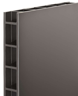
Top: ready-assembled 100 m 3 cooling water tank made of cross-ribbed SIMONA® PE 100 black Twin-Wall Sheets; bottom left: plastic tank with a bolted steel frame made of galvanised steel IPE sections; bottom right: cross-ribbed SIMONA® PE 100 black Twin-Wall Sheet

In Ingolstadt a state-of-the-art technology park called incampus was opened on a rehabilitated refinery site covering 75 hectares. As a zero-energy campus, this high-tech park is designed to generate just as much energy in future as it consumes. This innovative energy concept is to be realised with a water-based piping network, the so-called LowEx network. One integral part is a 100 m 3 cooling water tank made of cross-ribbed SIMONA® PE 100 black Twin-Wall Sheets.